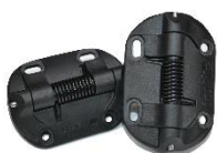
G8 Safe Fixed Tension Pool Gate Hinges