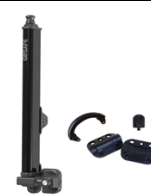
G8 Safe Mega Value Kit Consisting of; SL50H- Gate Latch SHG-90- Pool Compliant Hinges