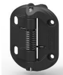
G8 Safe Fixed Tension Pool Gate Hinges with Legs